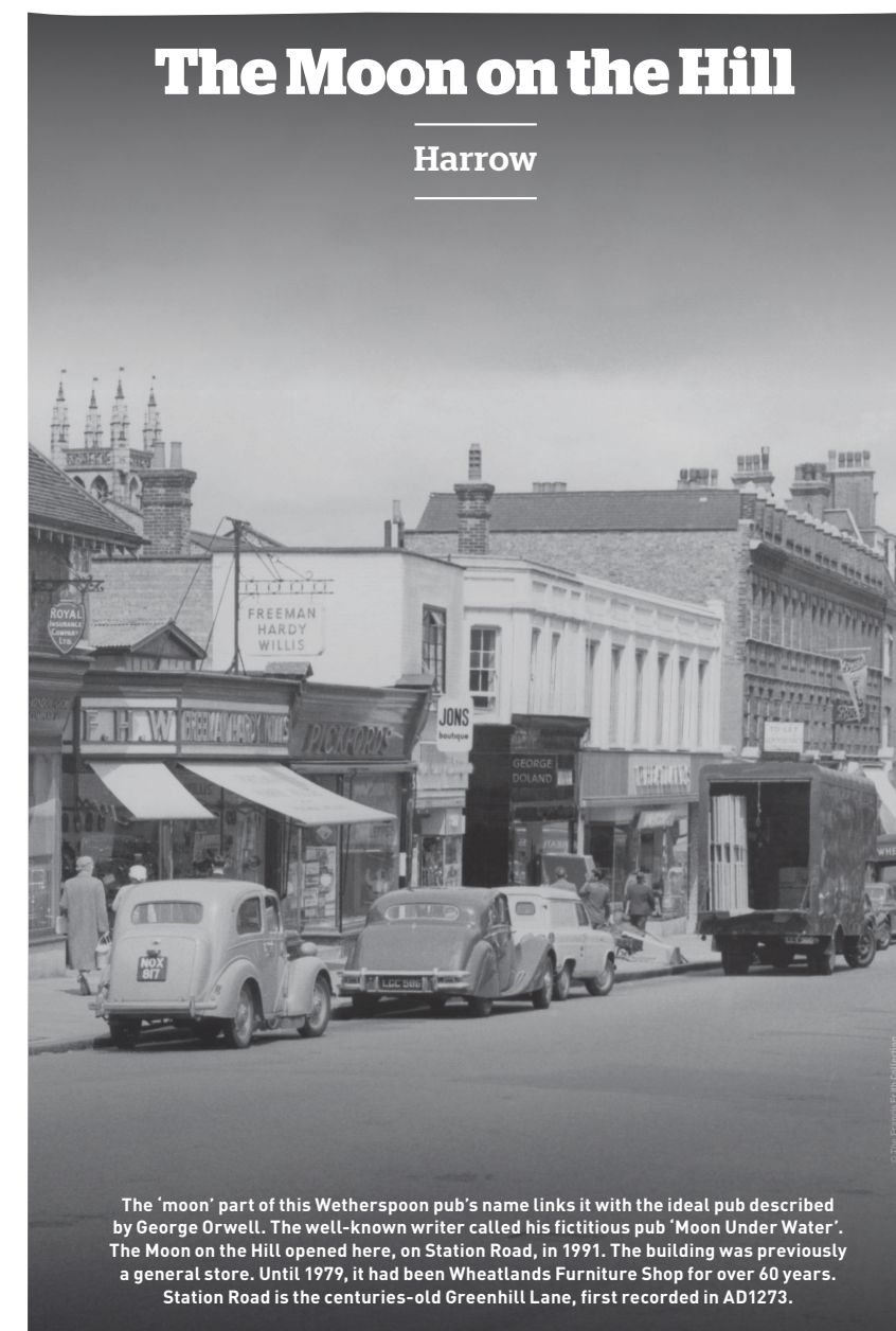
The 'moon' part of this Wetherspoon pub's name links it with the ideal pub described by George Orwell. The well-known writer called his fictitious pub 'Moon Under Water'. The Moon on the Hill opened here, on Station Road, in 1991. The building was previously a general store. Until 1979, it had been Wheatlands Furniture Shop for over 60 years. Station Road is the centuries-old Greenhill Lane, first recorded in AD1273.

Main menu 11.30am - 11pm. Children's menu available.